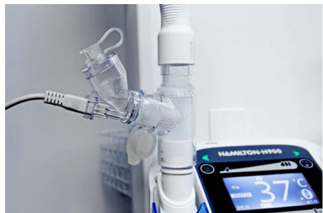
Use high flow oxygen therapy with Aerogen nebulizer (neonatal set-up).