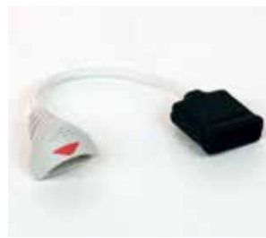
7705-001 Adapter Cable