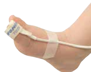
7427-003 Infant Flexi-form Sensor