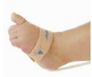
7426-004 Neo/Adult Cloth Sensor