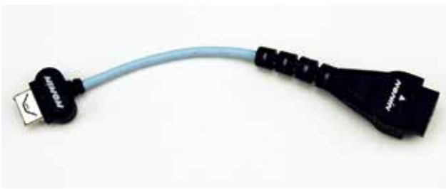
7704-001 Adapter Cable