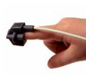
Reusable Small Soft Sensor