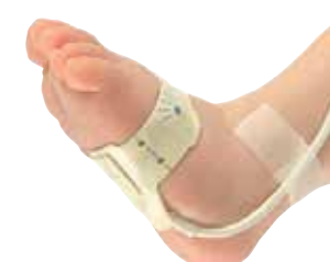
7427-004 Neo/Adult Flexi-form Sensor