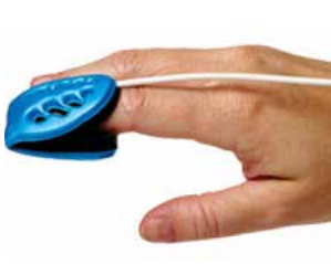
7229-000 Durafoam sensor