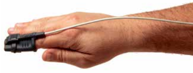
Reusable Large Soft Sensor