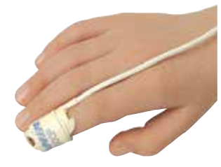
7427-002 Pediatric Flexi-form Sensor