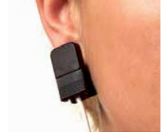
6455-000 Ear Clip Sensor