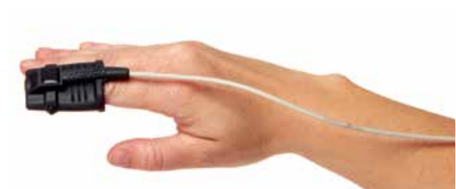
Reusable Medium Soft Sensor