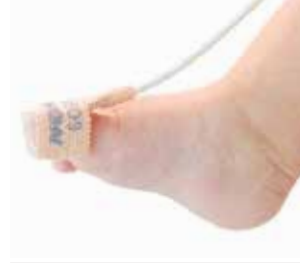
7426-003 Infant Cloth Sensor