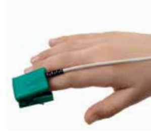
Pediatric Finger Clip Sensor