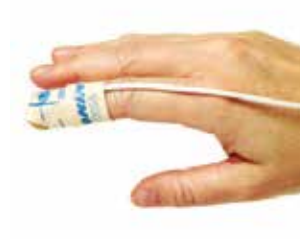
7427-001 Adult Flexi-form Sensor