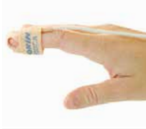
7426-001 Adult Cloth Sensor