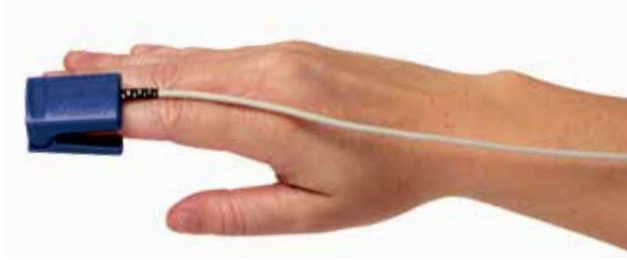
Adult Finger Clip Sensor