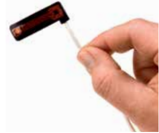
Neonatal Reusable Flex Sensor