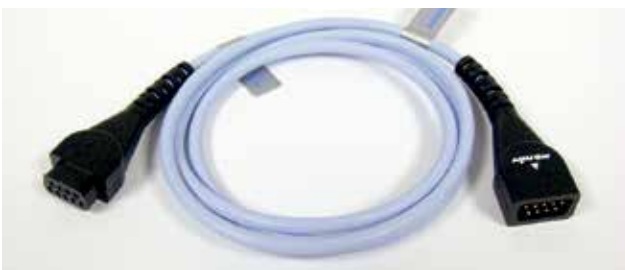
UNI Extension Cable