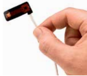
Infant Reusable Flex Sensor