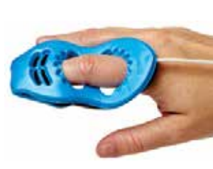
7233-000 Durafoam sensor