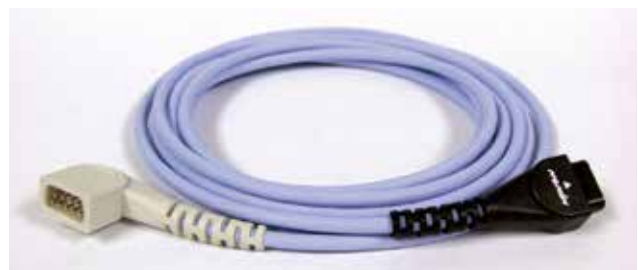
UNI Right Angle Connector