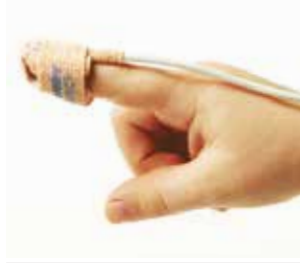
7426-002 Pediatric Cloth Sensor