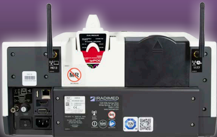
Reverse side of 3885B