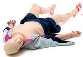
First aid/trauma limbs (arms and legs only)