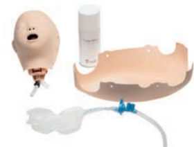
Resusci Baby Airway Head Upgrade