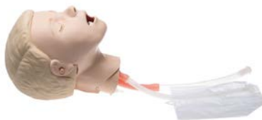
Resusci Junior Airway Head Upgrade