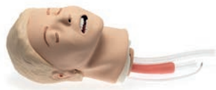
Resusci Anne Airway Head Upgrade