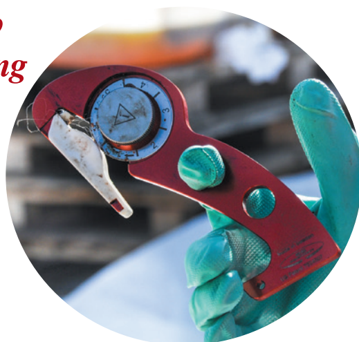
Oil recovery at Tjörn 2011*

S-CUT is an optimal tool when it comes to quickly removing clothing to start lifesaving measures. Compared with scissors and knives, the S-CUTs considerably shorten the time for cutting clothes in trauma situations, cardiac arrests, chemical accidents and hypothermia.