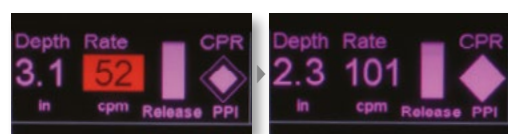
Inadequate compressions → Good compressions