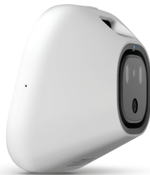
Camera and Thermometer