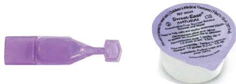
1 & 2 mL vials

The Sweet-Ease 24% sucrose and purified water solution is used to soothe the baby.