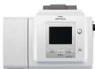
BiPAP A30 and BiPAP A40