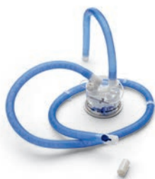
RT202 adult single limb heated circuit kit (1141426)