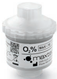
FiO 2 sensor assembly (1134668)