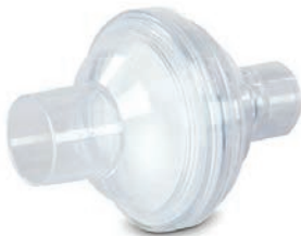
Bacterial filter (342077 10/pack)