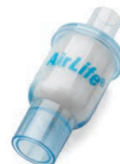
Airlife, adult (C06274)