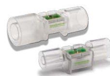
Disposable electronic flow sensor, adult and infant (1146497) (1146558)