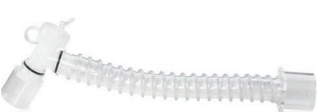
Flexible trach adapter with 22 mm connection (1073902/pack) Connects to exhalation ports used with the passive circuit.