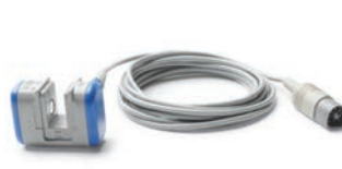
Capnostat cable (M2501A)