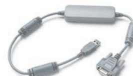
Cable, isolated, USB to DB9 (1127405)