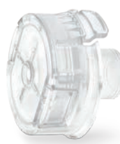
Dual limb AEV (1139436 10/pack) (1132110 1/pack)