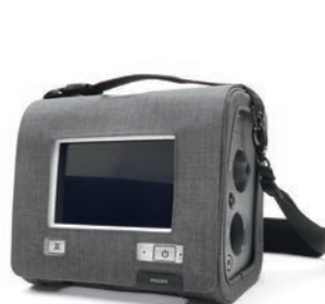
Trilogy Evo in-use case (1133930)