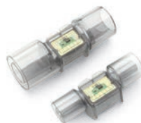
Electronic flow sensor, adult and infant (1134711) (1134712)