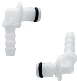
Oxygen inlet adapter (1040390)