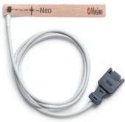
Pulse oximeter sensor, neonatal (1065306)