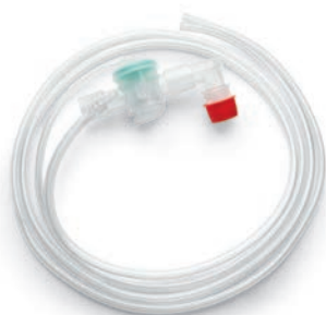
Disposable active exhalation valve (1131661 10/pack)