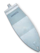
Test lung (1021671)