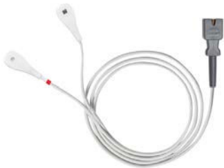
Re-usable multisite SpO 2 sensor (Masimo) (1081985)