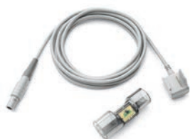
Electronic flow sensor accessory with cable, adult/ped (1132106 )