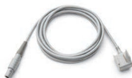
Electronic flow sensor cable (1134592)