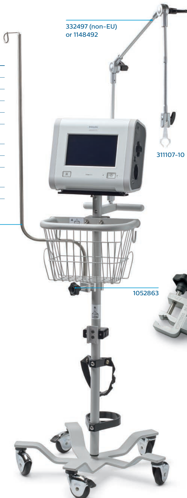
332497 (non-EU) or 1148492