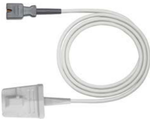
Re-usable adult soft SpO 2 sensor (Masimo) (1081516)