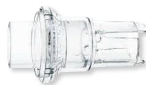
Whisper swivel II (332113)