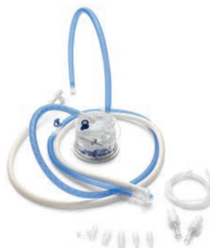
RT265 Fisher & Paykel infant dual limb (1141548)