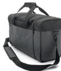
Trilogy Evo travel bag (1134428)