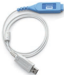
External pulse oximeter (Nonin XPOD - USB cable) (1129640)