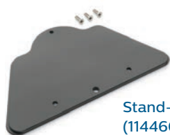
Stand-alone mounting plate (1144668)