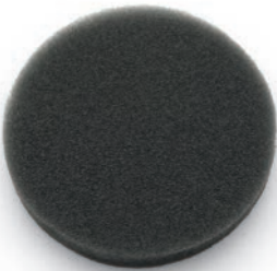
Air Inlet Foam Filter (1134591 10/pack)