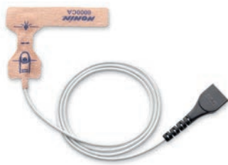
Pulse oximeter sensor, adult (1070692), pediatric (1070693), infant (1070694)