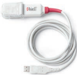
External pulse oximeter (Masimo USB cable) (1145408)