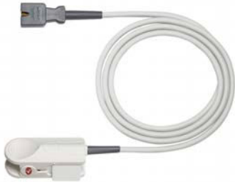
Re-usable adult finger clip SpO 2 sensor (Masimo) (1081984)