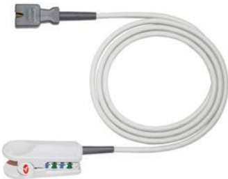
Re-usable ped finger clip SpO 2 sensor (Masimo) (1072878)