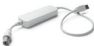
Capnostat USB adaptor (1127404)