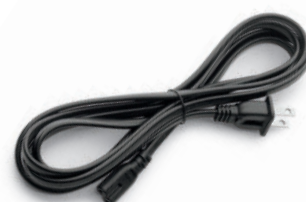
Power cord, straight C7 end - 8ft