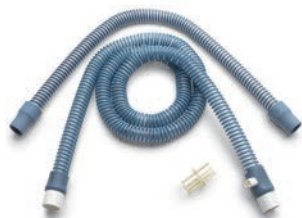
Fisher & Paykel 900MR810 reusable circuit (1141549)