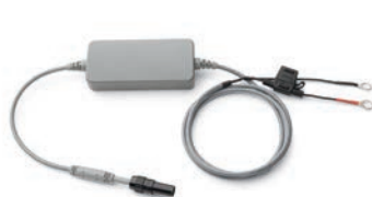
Cable, 12/24V battery with terminals (1127401)