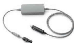
Cable, 12/24V battery with car adaptor (1127402)