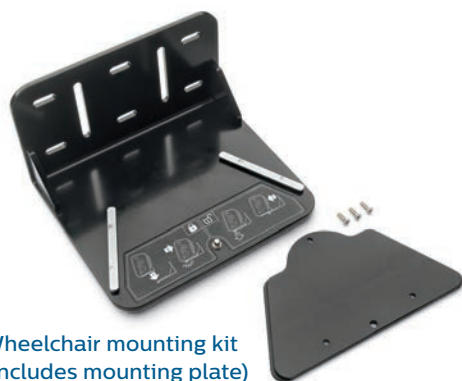
Wheelchair mounting kit (includes mounting plate) (1134633)