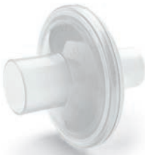
Bacterial/viral filter (1147018 10/pack)