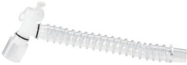
Flexible trach adapter with 15 mm connection (1073863 10/pack) Connects to the flow sensor of the active exhalation valve.