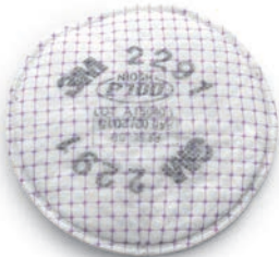
Particulate filter (1134430 10/pack)