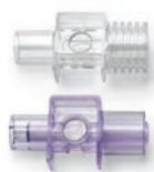
Capnostat airway adaptor (6312-00) (6063-00)