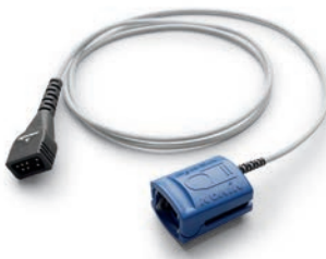
Re-usable adult SpO 2 sensor (Nonin) - pediatric (936P), adult (936)