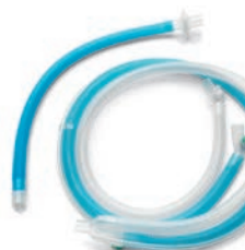
(15mm 1127304)* (22mm 1127303)*