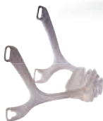
Wisp silicone frame